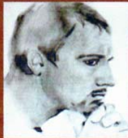
A Sampling of last month's artwork.