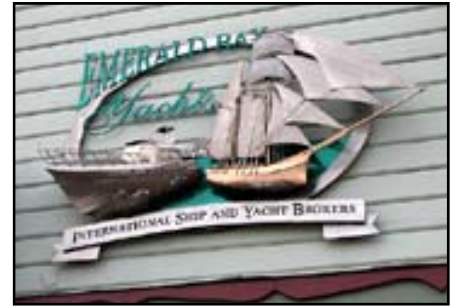
Emerald Bay Yachts - signage