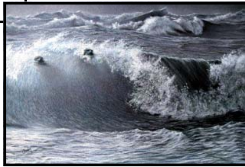
Searching Out the Perfect Wave by Christy Camerer