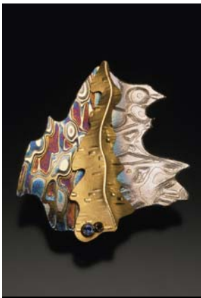
Tidelands Peninsula- modeled on Jo-Emma Beach on the Key Peninsula

Joan's home has been transformed into a working space dedicated to her needs. She has a beautiful home on a rise above a cul-de-sac. When you enter the front door, you don't find yourself in a typical suburban living room. You walk into a room with hardwood floors (carpet replaced) and a custom made work station filling the front bow-window. Behind the work station is another bench holding machines for cutting metal, making wire, shaping, bending, texturing and any kind of metal manipulating that can be thought up. Joan has it all at her finger tips and she knows how to use it all to perfection. Her creations from precious metals and gemstones are hand fabricated to form unique, beautiful, wearable works of art.